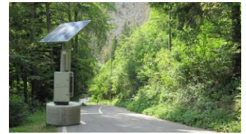
System-Voltage: 230 V AC | Photovoltaics: 390 Wp | Battery: 5 kWh | Inverter: 200 W | Location: Solothurn - Switzerland