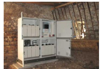
System-Voltage: 230 V AC | Photovoltaics: 540 Wp | Battery: 15 kWh | Inverter: 2300 W | with UPS | Batterie Charger: 0 – 55 A | Location: Valais - Switzerland