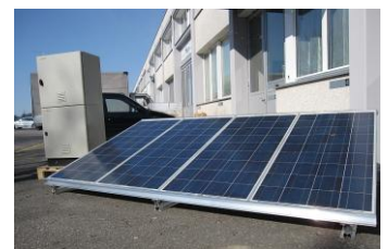
System-Voltage: 230 V AC | Photovoltaics: 540 Wp | Battery: 5 kWh | Inverter: 1600 W | with UPS | Batterie Charger: 0 – 37 A | Location: El Hierro - Spain