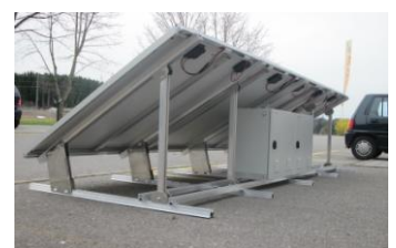
System-Voltage: 230 V AC | Photovoltaics: 780 Wp | Battery: 5 kWh | Inverter: 300 W | Location: Dubai - UAE